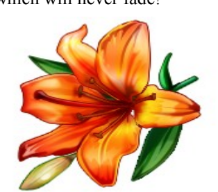
"Each seed has its own body"

of decay, it is raised unable So I'm not going to waste time to decay. It is planted in a trying to keep my seed from shriveling. In fact, I'm looking raised in glory: it is sown in forward to my glorious flower which will never fade!